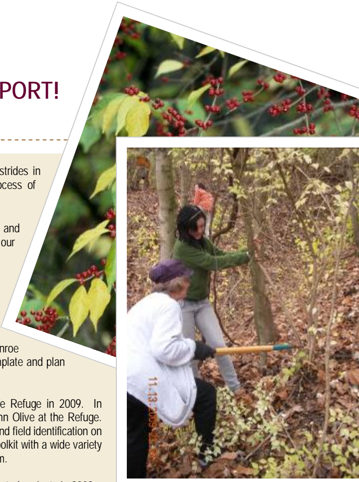
Bush Honeysuckle Removal

SOUTHERN INDIANA COOPERATIVE WEED MANAGEMENT AREA.