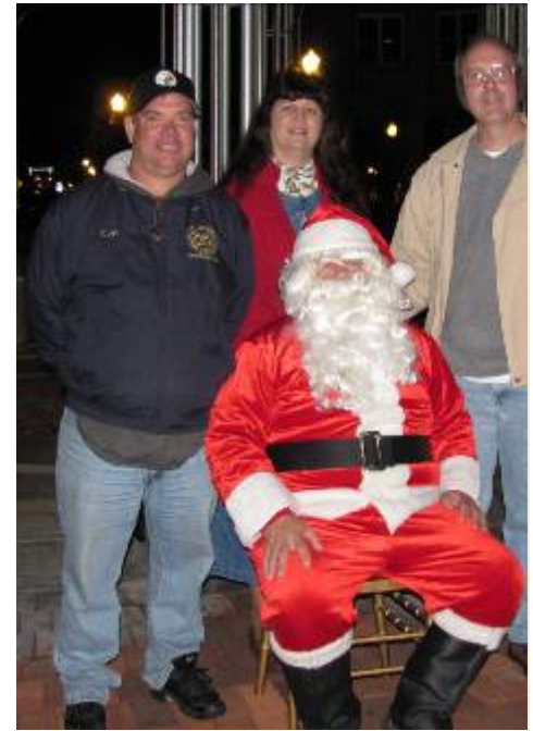
Twelve Days of Christmas, 2009

Orange County Main Street plans on making the 'Twelve Days of Christmas' program an annual event.