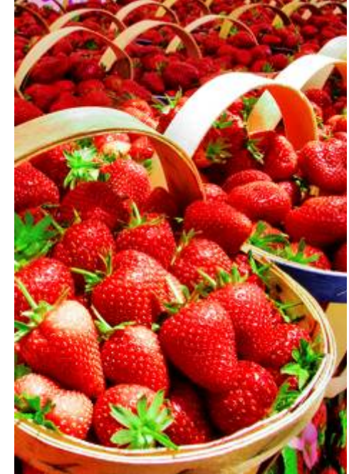
Farm Fresh Strawberries

The Bedford Farmer's Market is featured weekly during the months of May through October. The goal of this organization is to create awareness and support for local farmers and gardeners by making their locally grown products directly assessable to the public. With assistance from White River RC&D, the Bedford Farmer's Market will display six 2'x4' vertical banners along the perimeter of Bedford's town square. The banners will be displayed for seven months throughout the year.