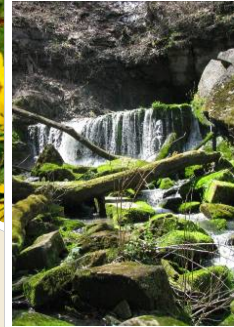
Cave River Valley, 2009